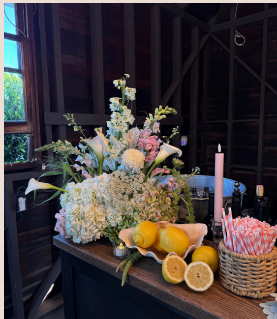
Dreamy Al Fresco Summer Garden Wedding with Vintage Touches