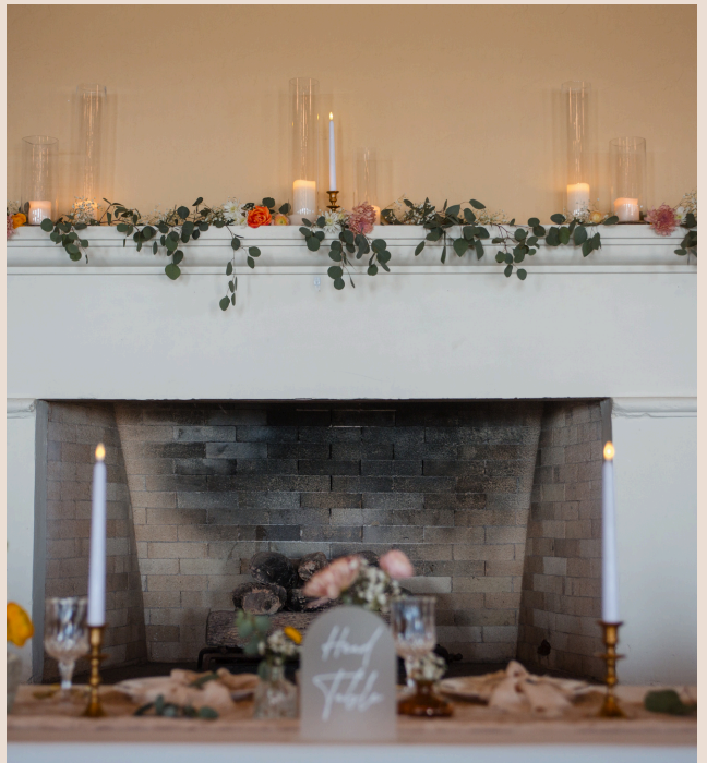
A Classic Wedding Design with Boho and Coastal Touches